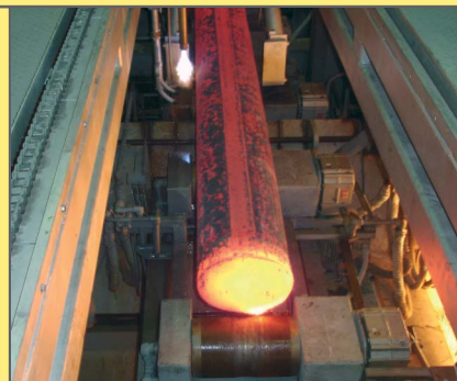
Roller conveyor drive with water-cooled angle parallel shaft geared motors

Further information on the WATT product range can be found on our website at www.wattdrive.com .